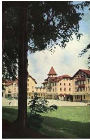
The villa in color, circa 1960

Read and post comments | Send to a friend