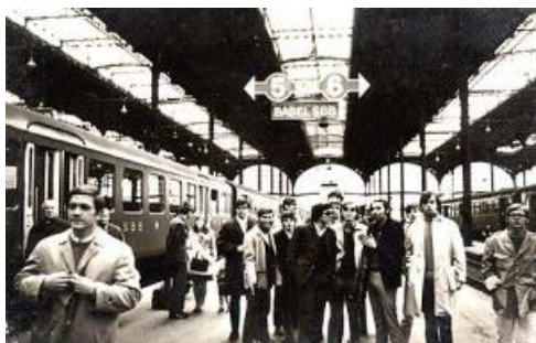
The class of '69

See you later dear friends. Amen. Sounds like a Beatles song ... " It was forty years ago today, Sgt. Pepper told his band to play... "yea yea I know that just sounds..