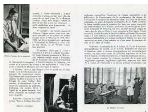
Yearbook for 1954-55