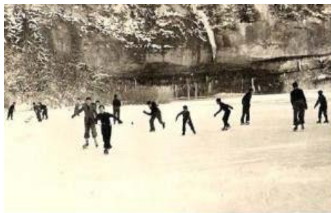
Ice skating on the Sarine

Read and post comments | Send to a friend