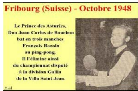
Gallia ping pong, 1948

Read and post comments | Send to a friend